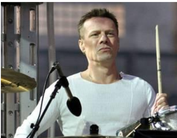
Larry Mullen, Jr.

U2 star Larry Mullen, Jr. has made his acting debut opposite Donald Sutherland in the English-language remake of acclaimed Patrice Leconte movie The Man On The Train .