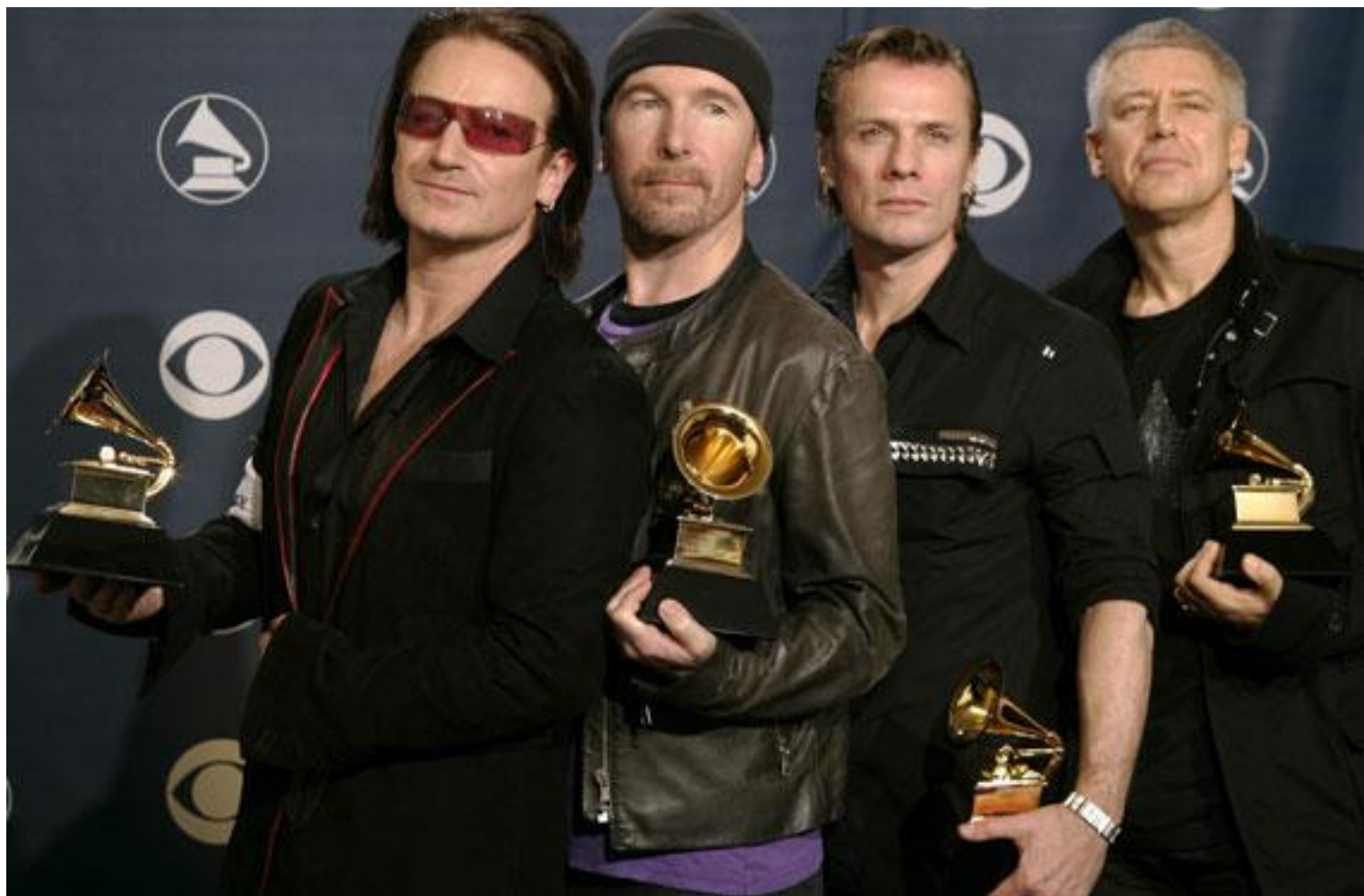
Drummer Larry Mullen (second right) with the other U2 members. The musician is to make his acting debut alongside Donald Sutherland.